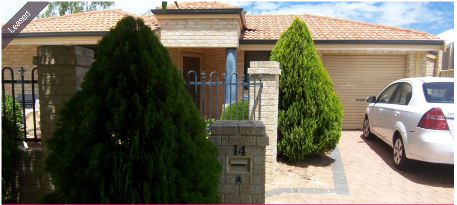
14A Medhurst Crescent, Nollamara