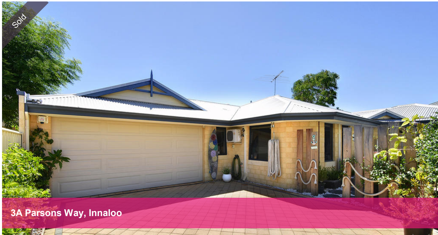
3A Parsons Way, Innaloo