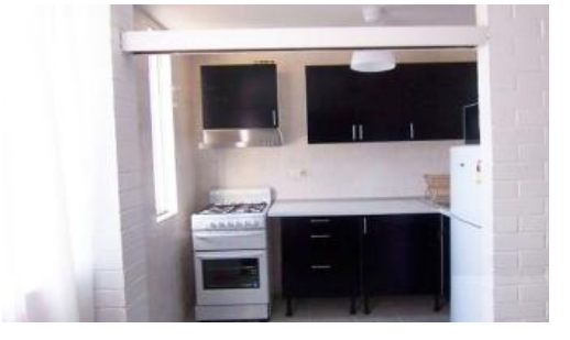
🛏 1 🔊 1 🖨 1

Tenant Reward Program: At Xceed Real Estate we have a Tenant Reward Program for our tenants who pay their rent on time & keep their property