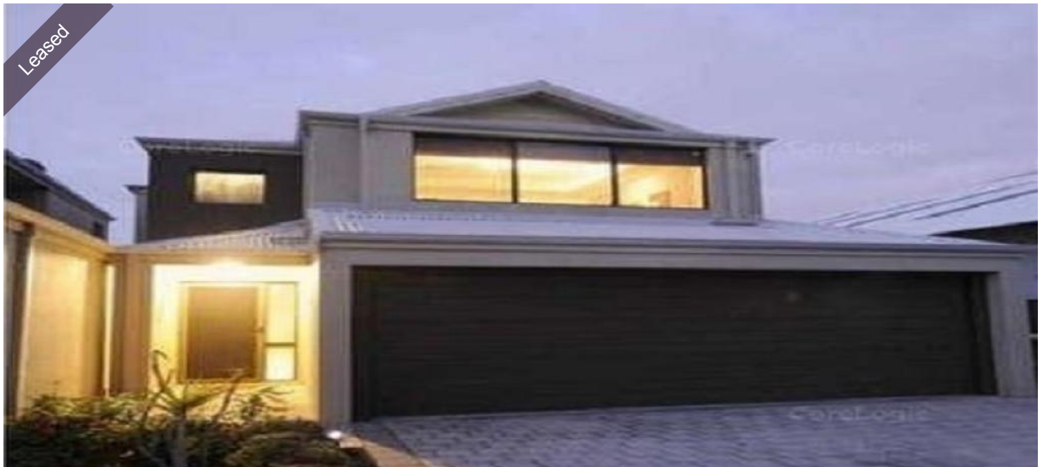
Unit 4, 110 Caledonian Ave, Maylands