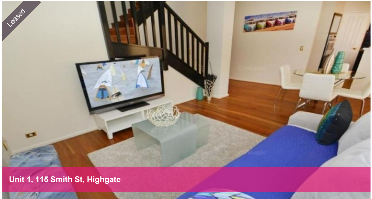
Unit 1, 115 Smith St, Highgate