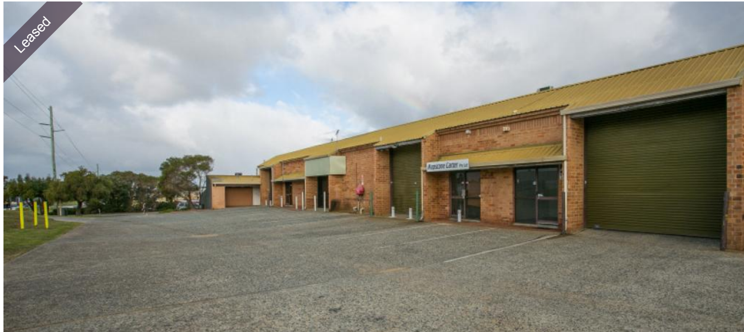
Unit 5, 136 Balcatta Rd, Balcatta