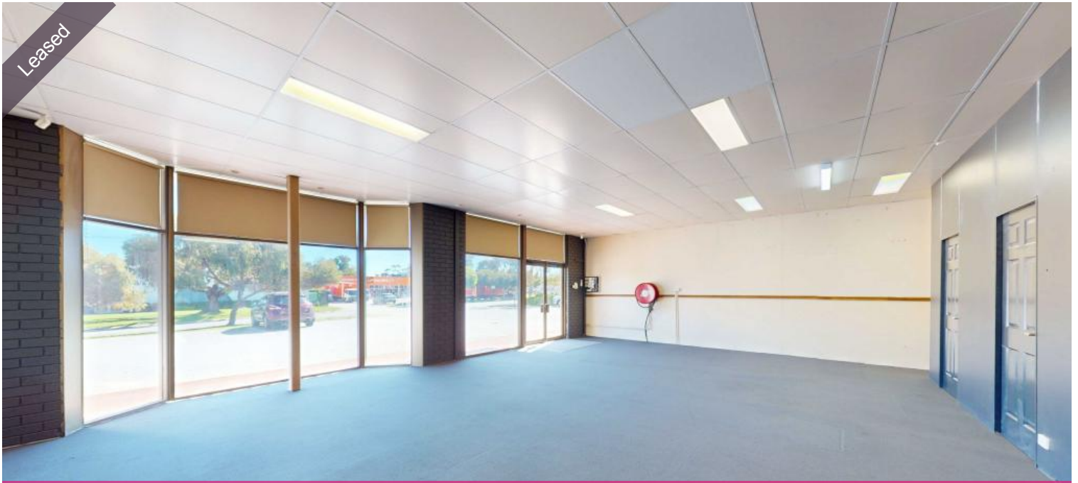
Unit 2, 200 Balcatta Road, Balcatta