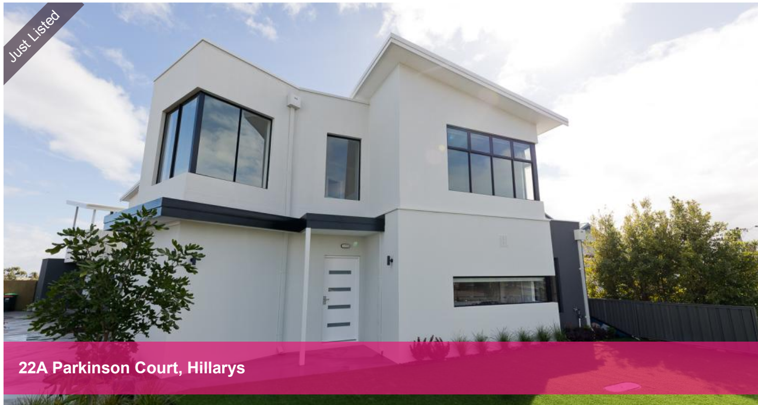
22A Parkinson Court, Hillarys