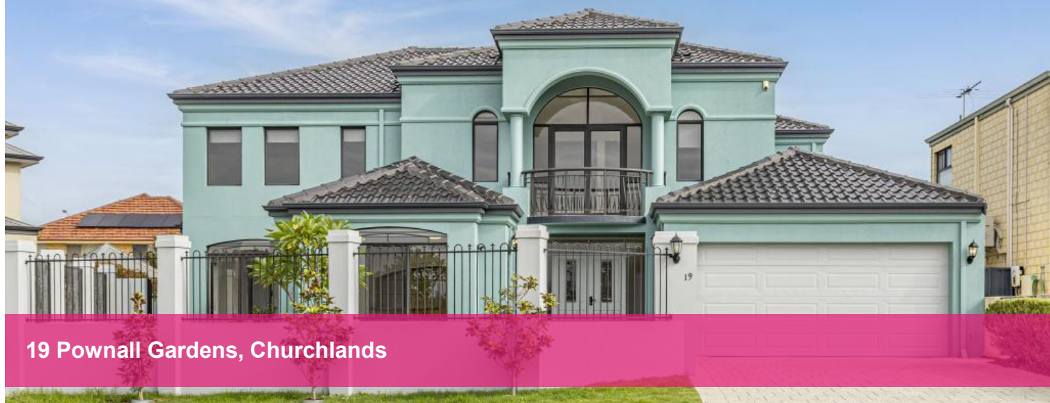
19 Pownall Gardens, Churchlands