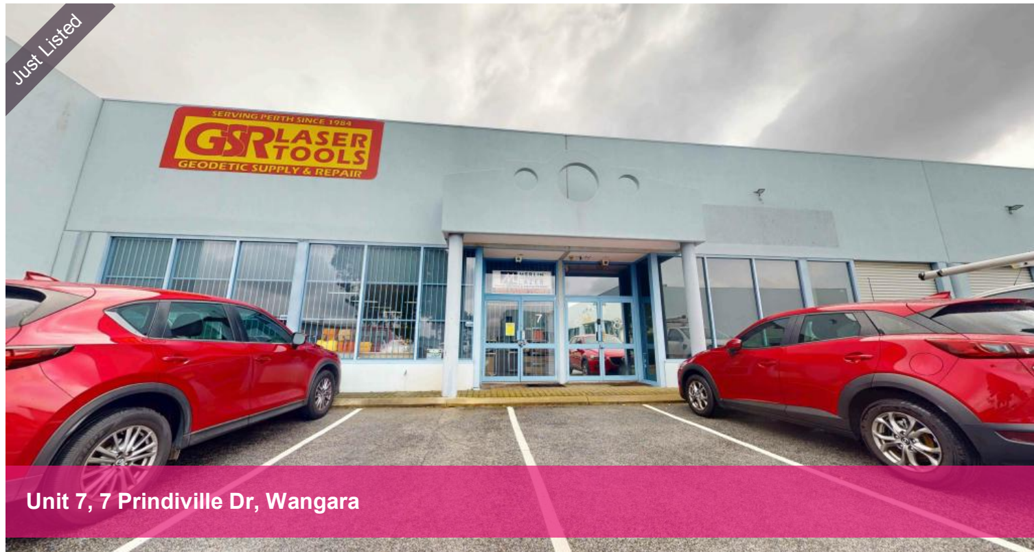
Unit 7, 7 Prindiville Dr, Wangara