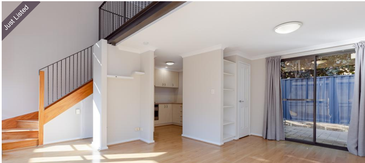
5B Mcrae Ct, Padbury