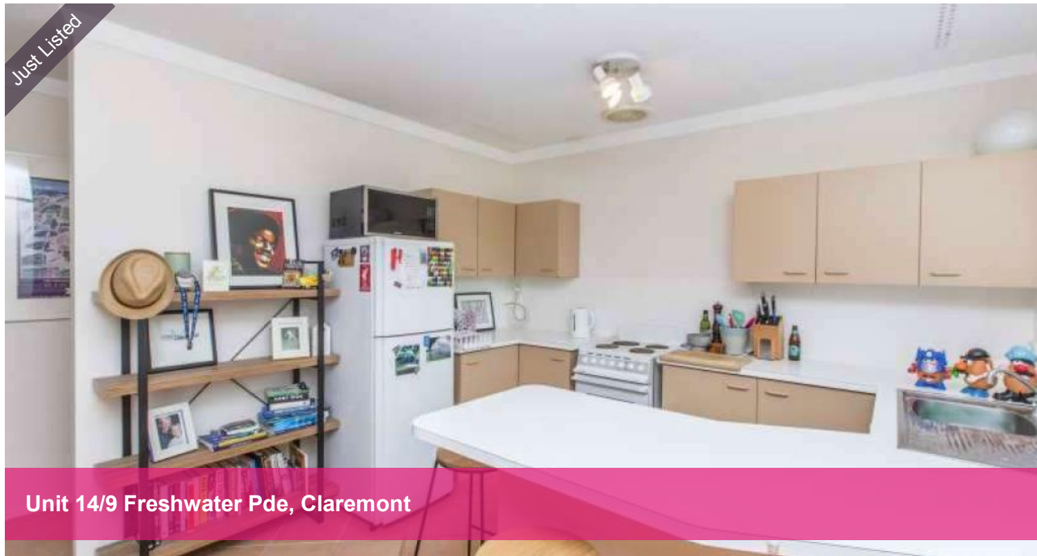
Unit 14/9 Freshwater Pde, Claremont