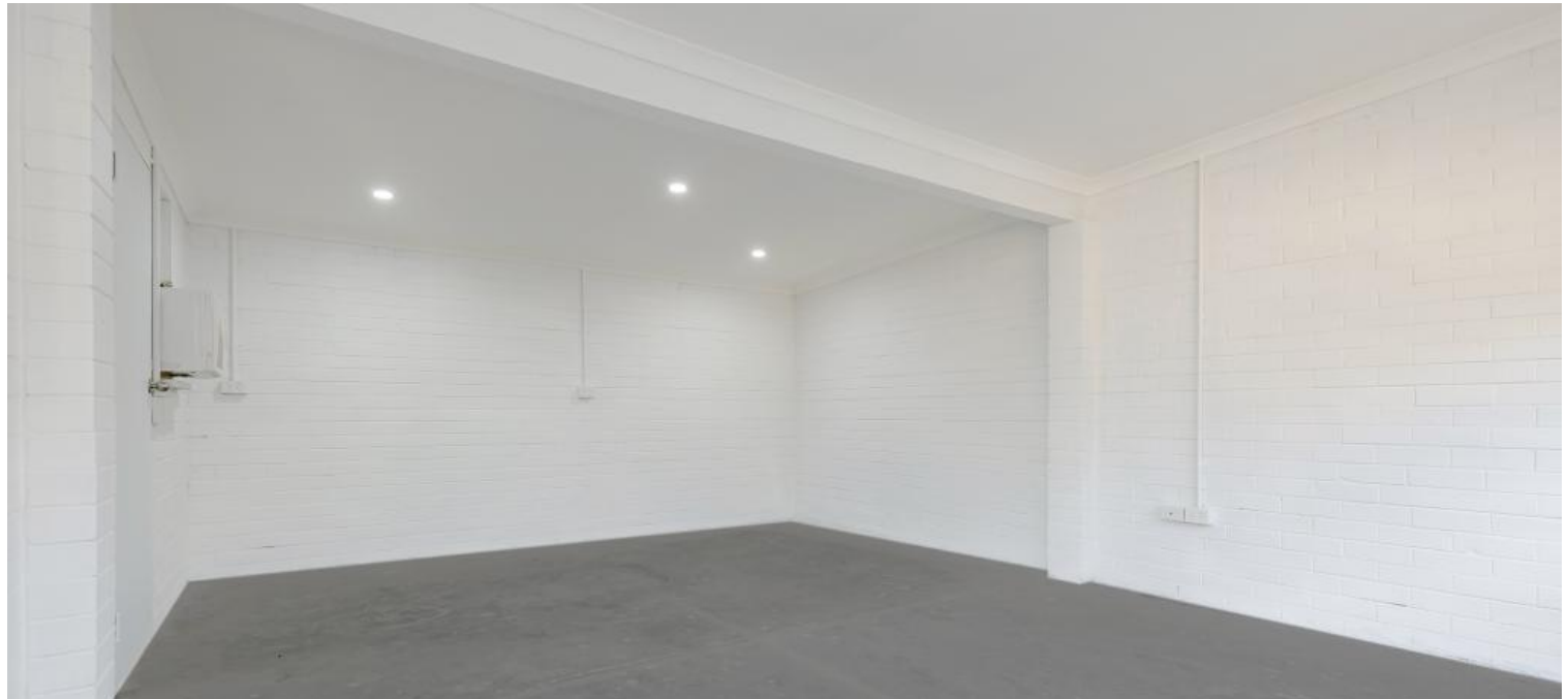
6B Angela Way, Maddington