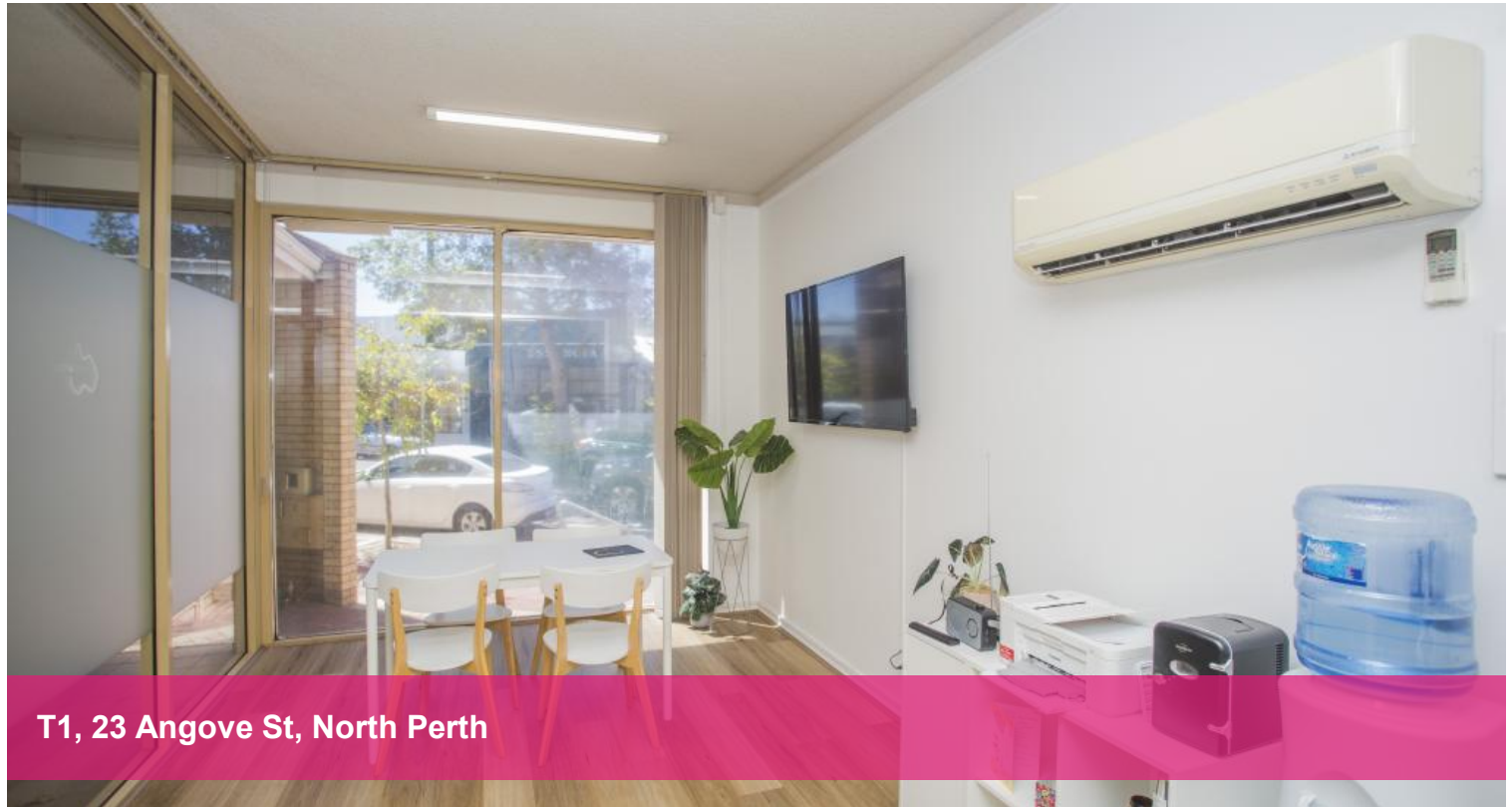
T1, 23 Angove St, North Perth