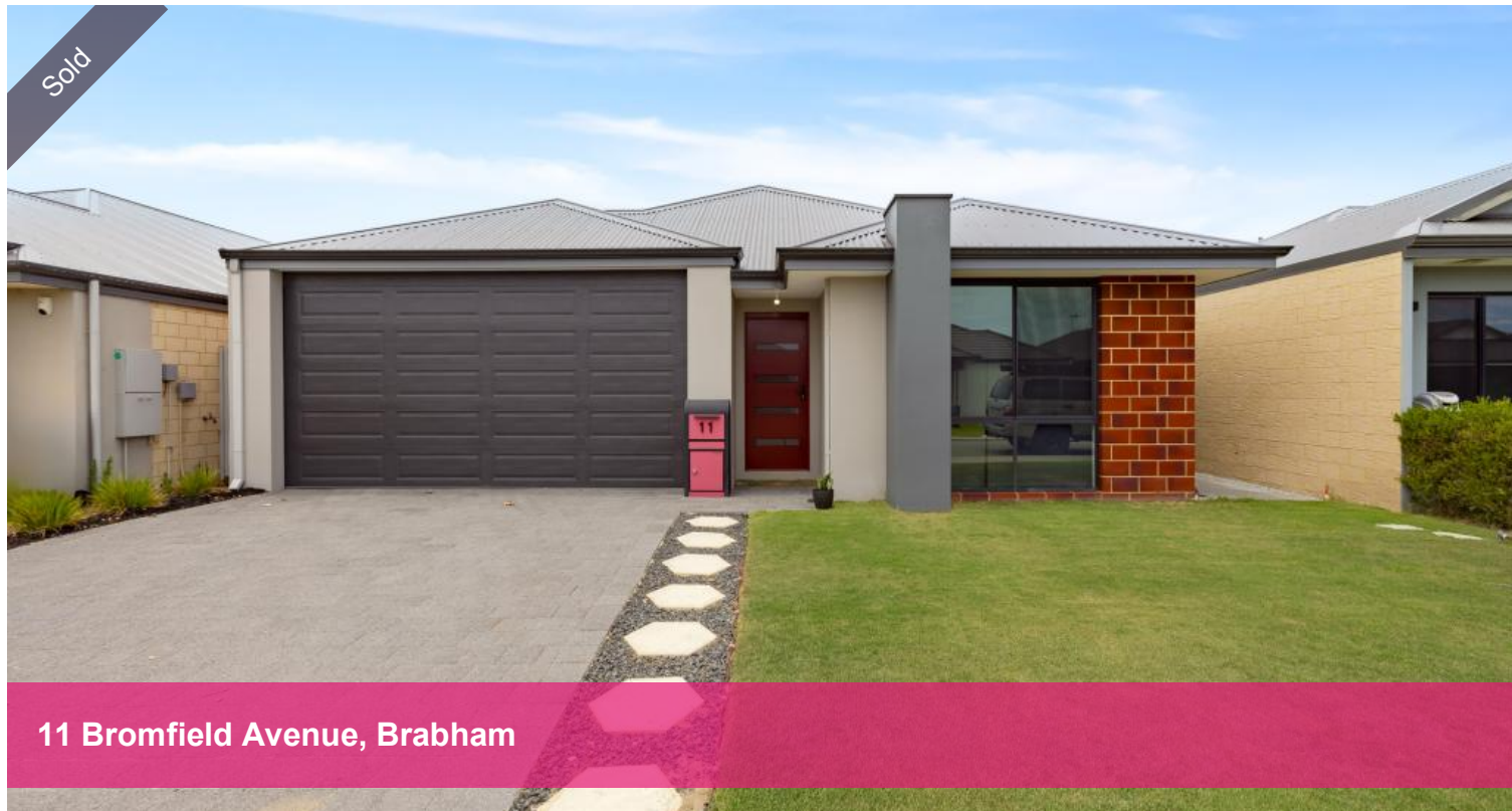
11 Bromfield Avenue, Brabham