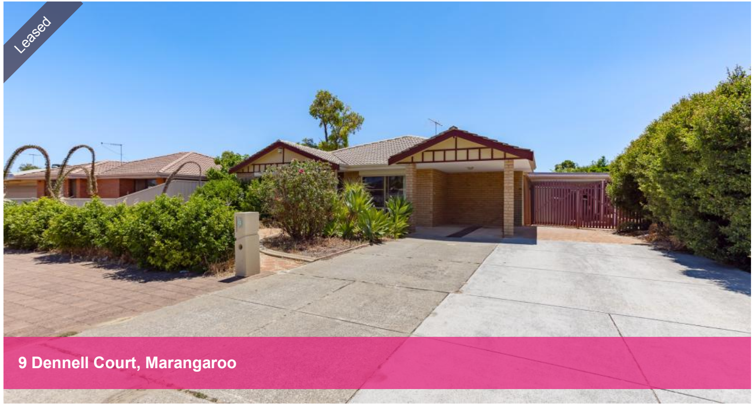
9 Dennell Court, Marangaroo