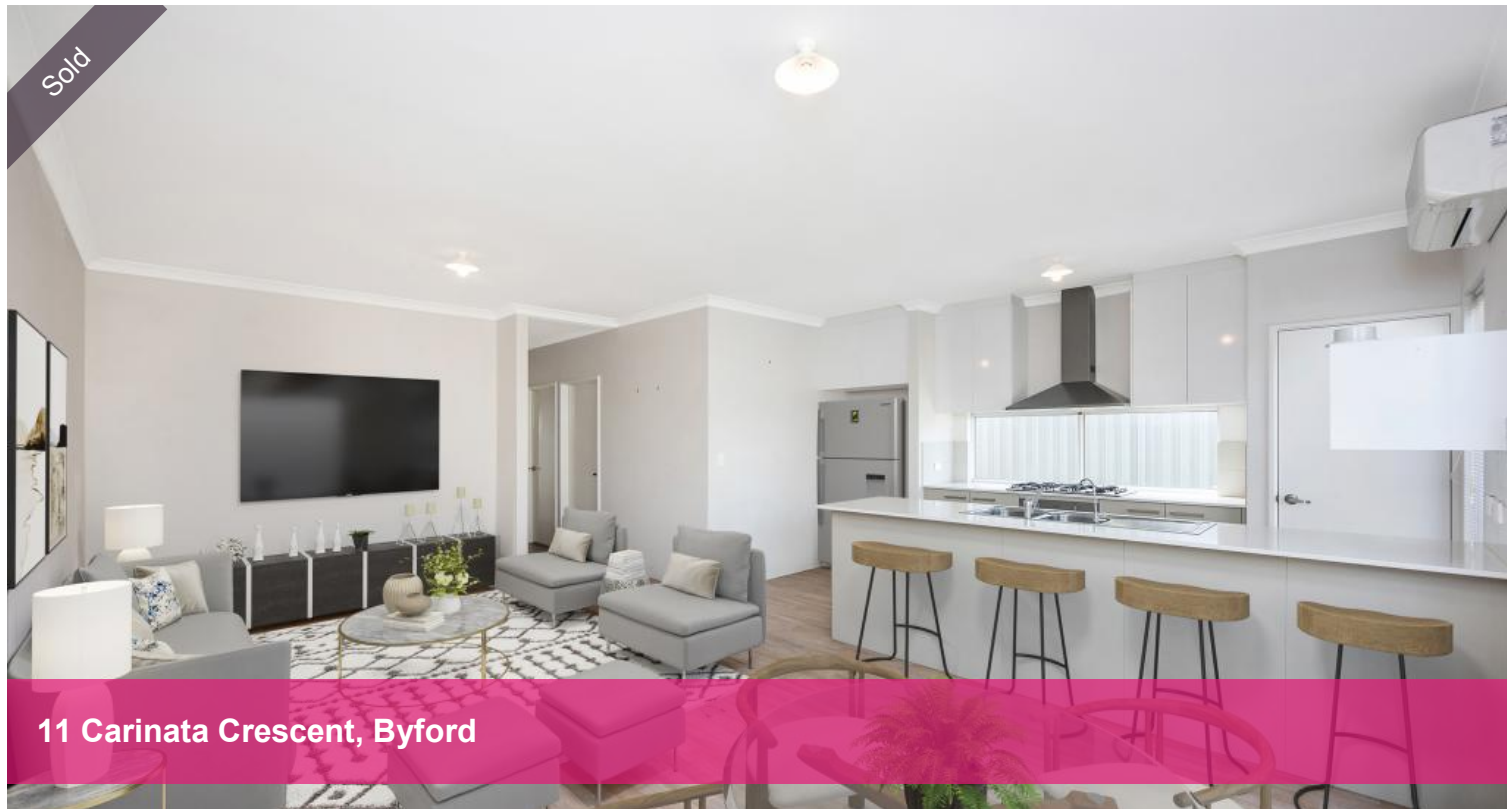
11 Carinata Crescent, Byford