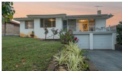
362 The Strand, Dianella