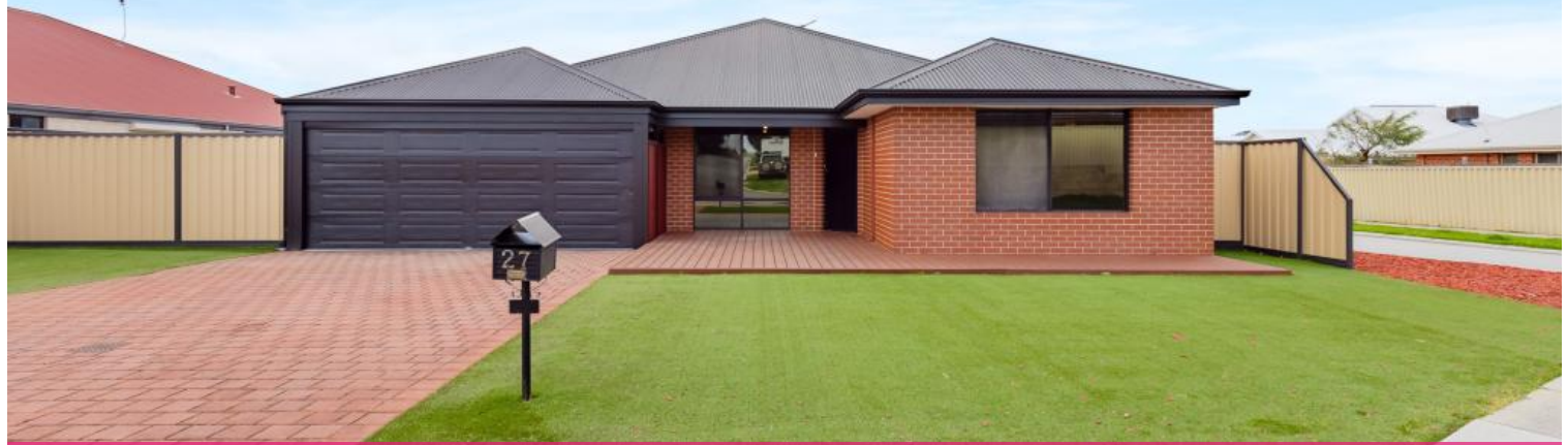
27 Champaign Drive, Tapping