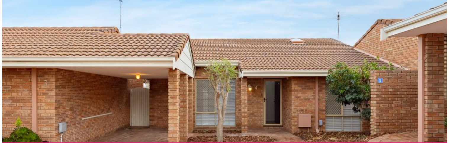
4/7 Carey Court, Kingsley