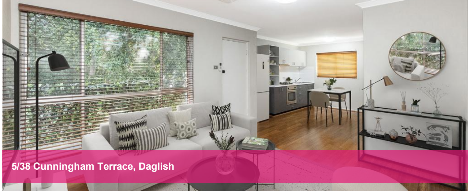
5/38 Cunningham Terrace, Daglish