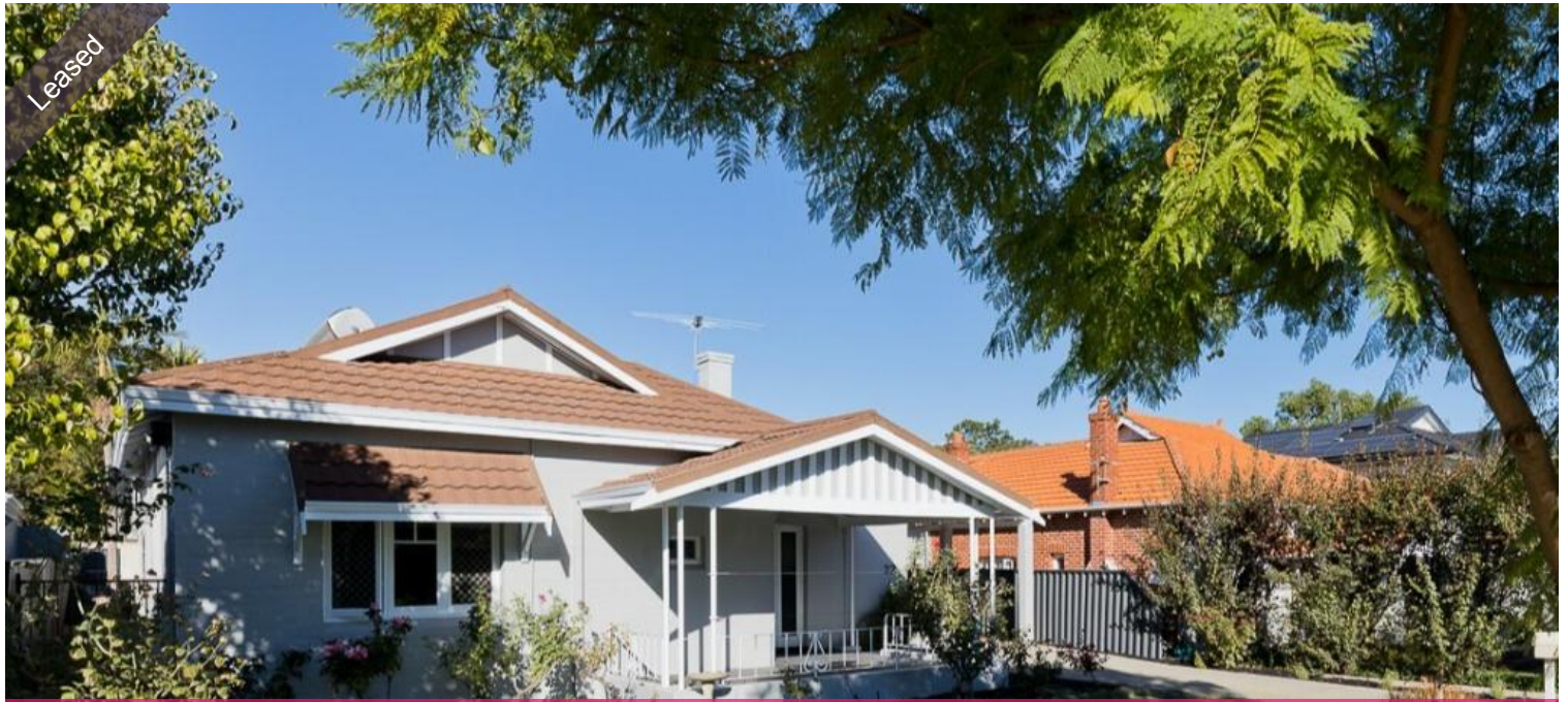
22 Daglish St, Wembley