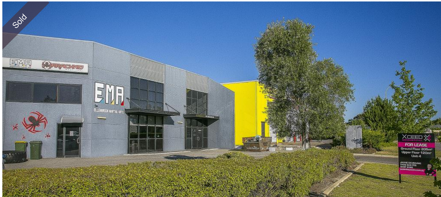
Unit 4, 10 Comserv Loop, Ellenbrook