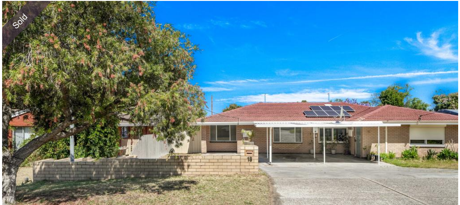
18 Sharon Drive, Carine