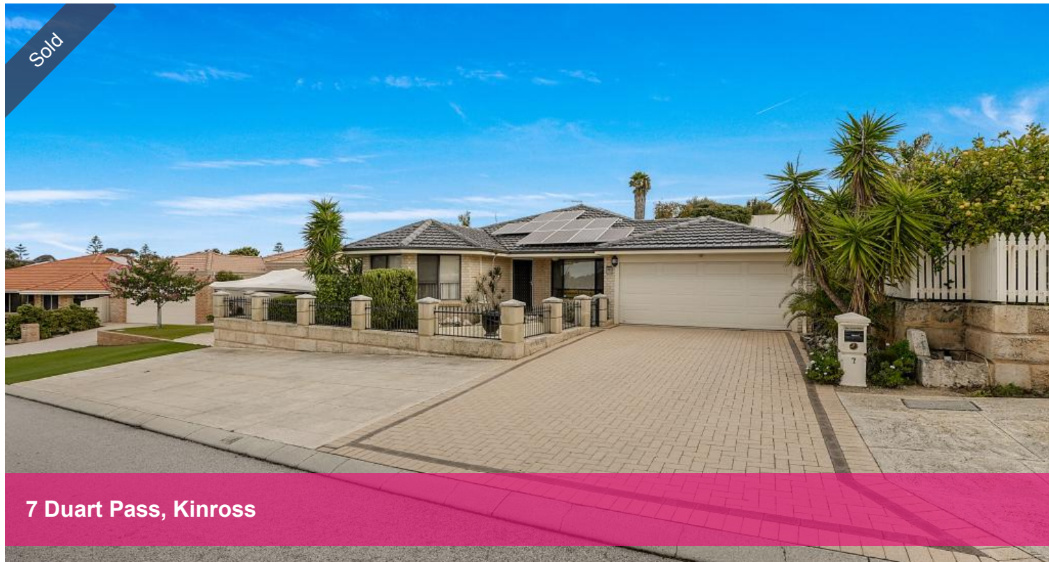
7 Duart Pass, Kinross