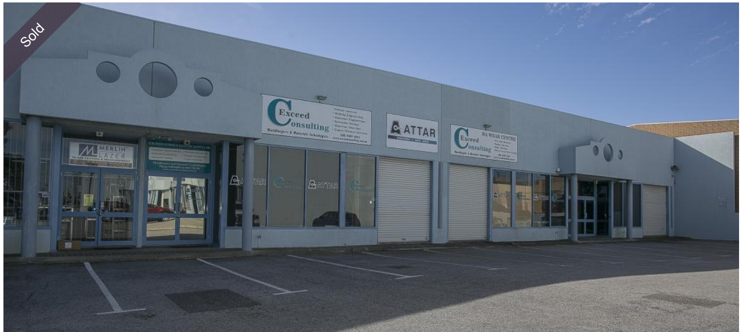
8 & 9, 7 Prindiville Drive, Wangara