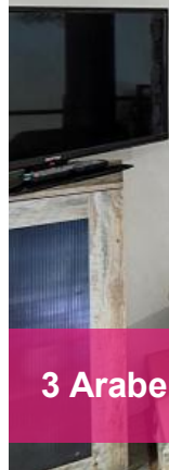
3 Arabella Mews, Currumbine