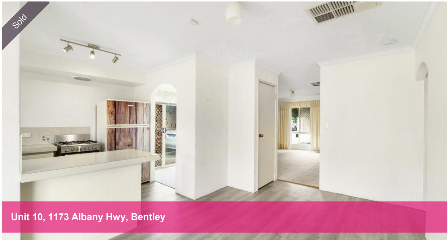
Unit 10, 1173 Albany Hwy, Bentley