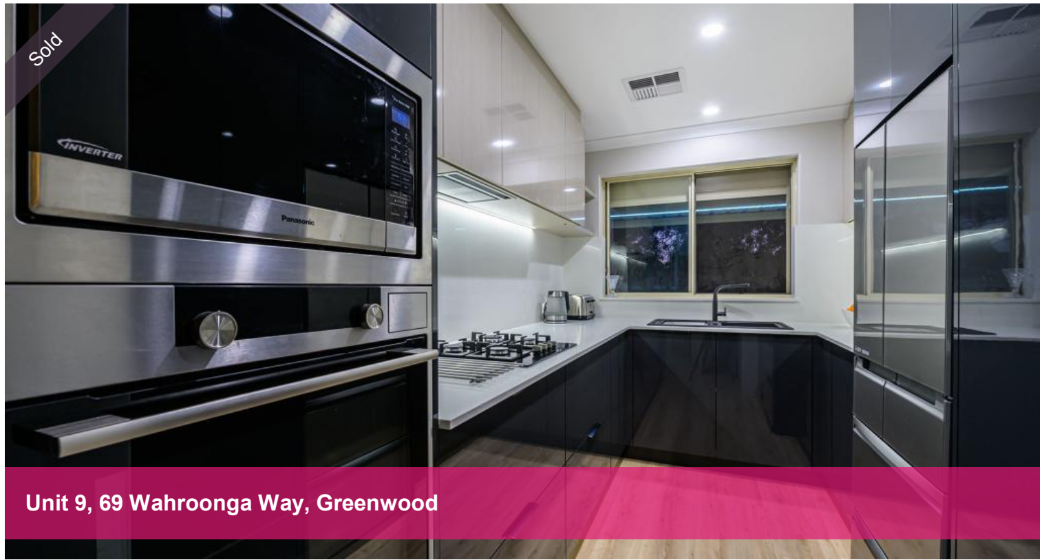
Unit 9, 69 Wahrenonga Way, Greenwood