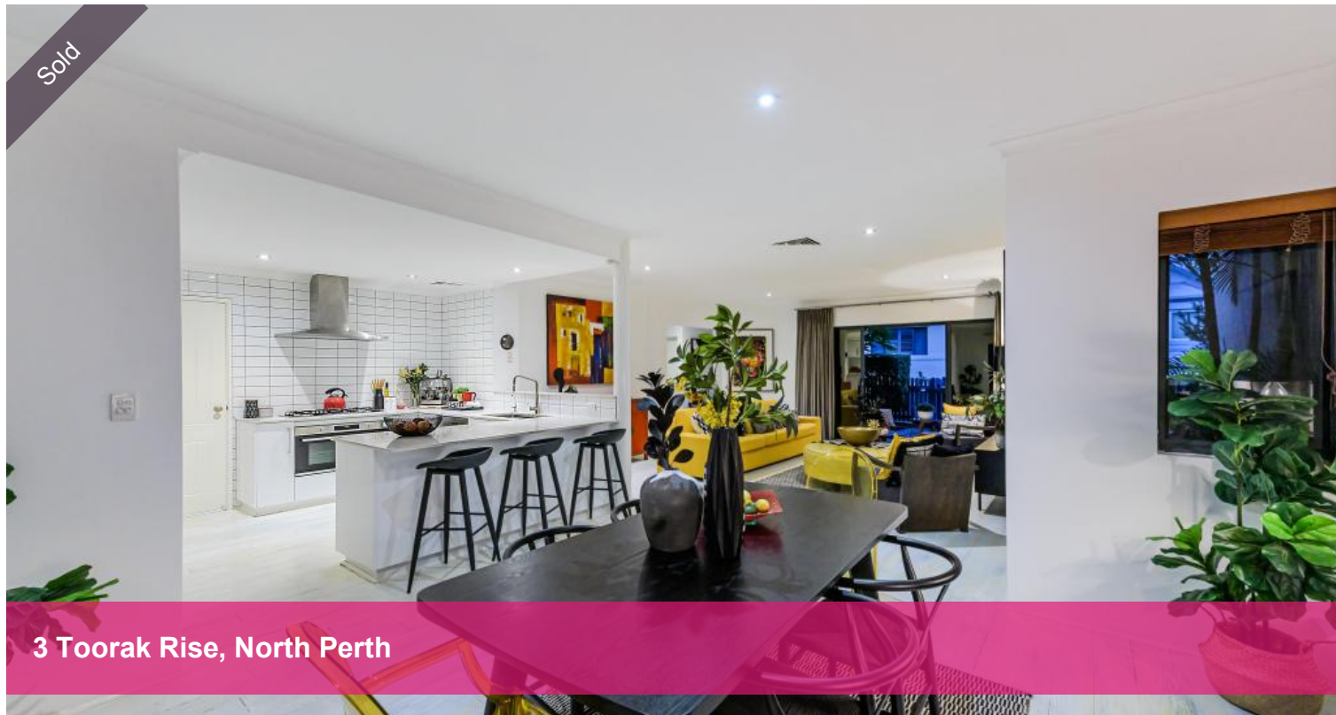
3 Toorak Rise, North Perth