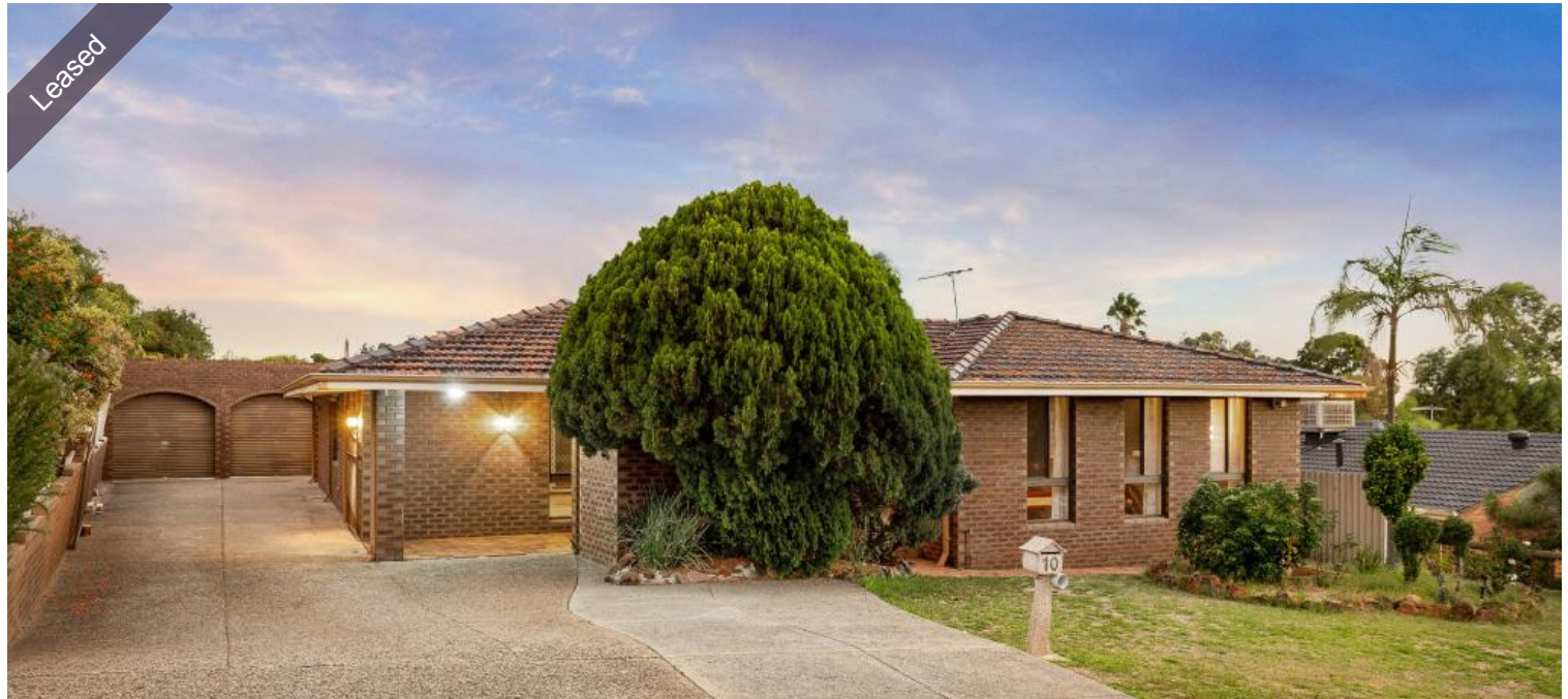
10 The Ramble, Woodvale