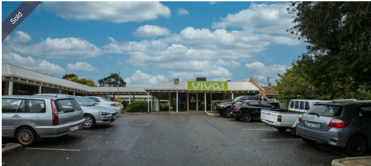
Unit 8, 42 Commerce Ave, Armadale