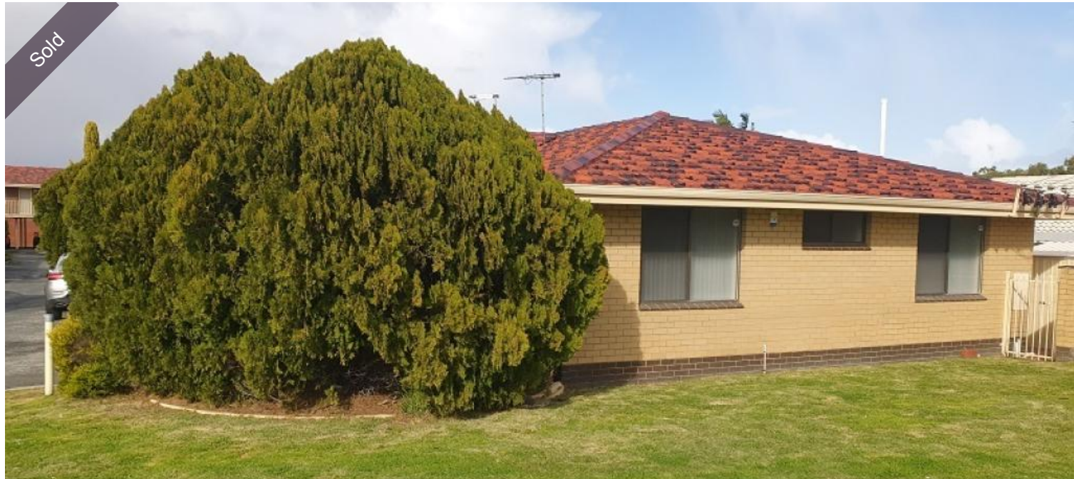
Unit 20, 168 Hector Street, Osborne Park