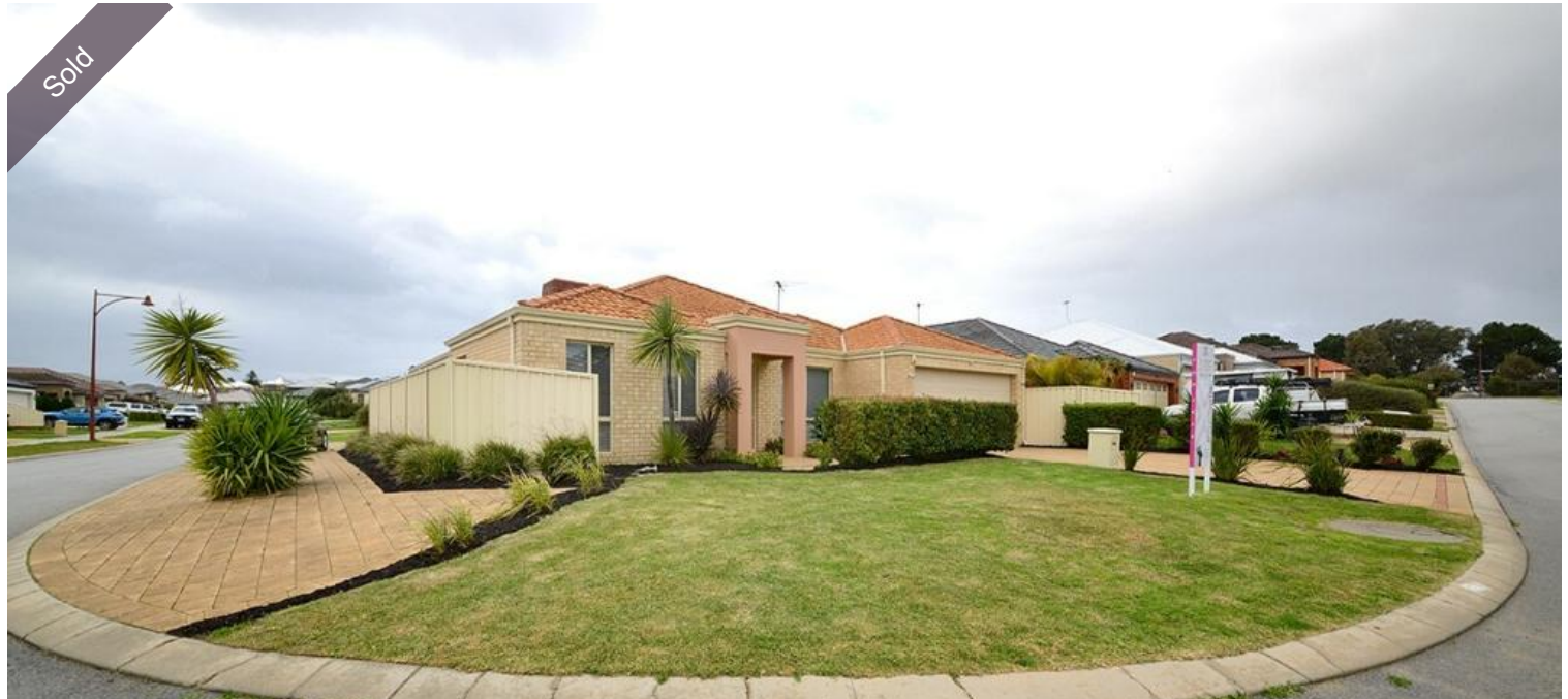
12 Pando Crescent, Landsdale