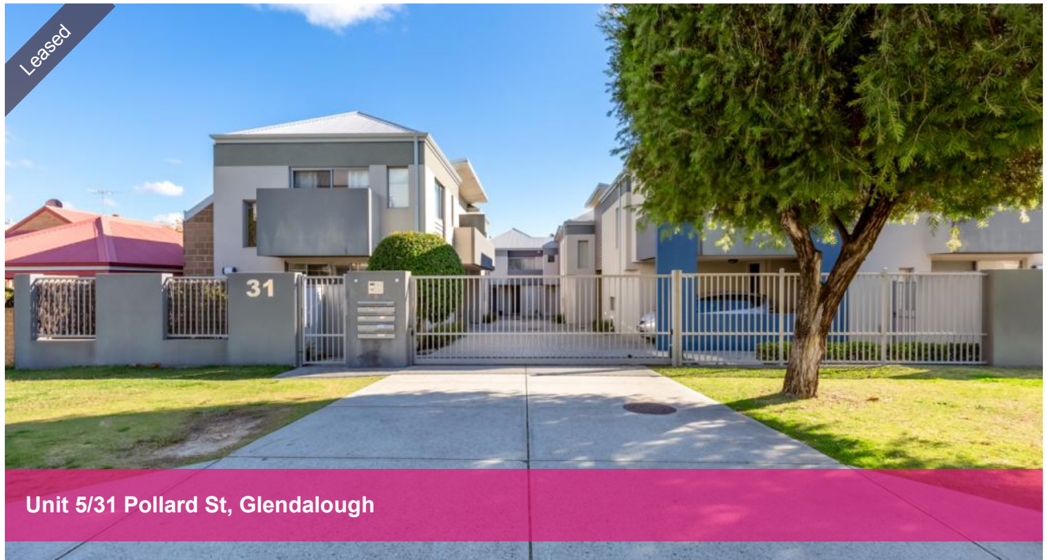
Unit 5/31 Pollard St, Glendalough