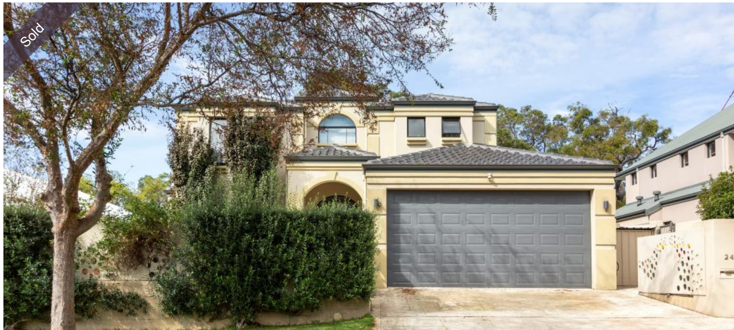
24 Winterbell Ct, Churchlands