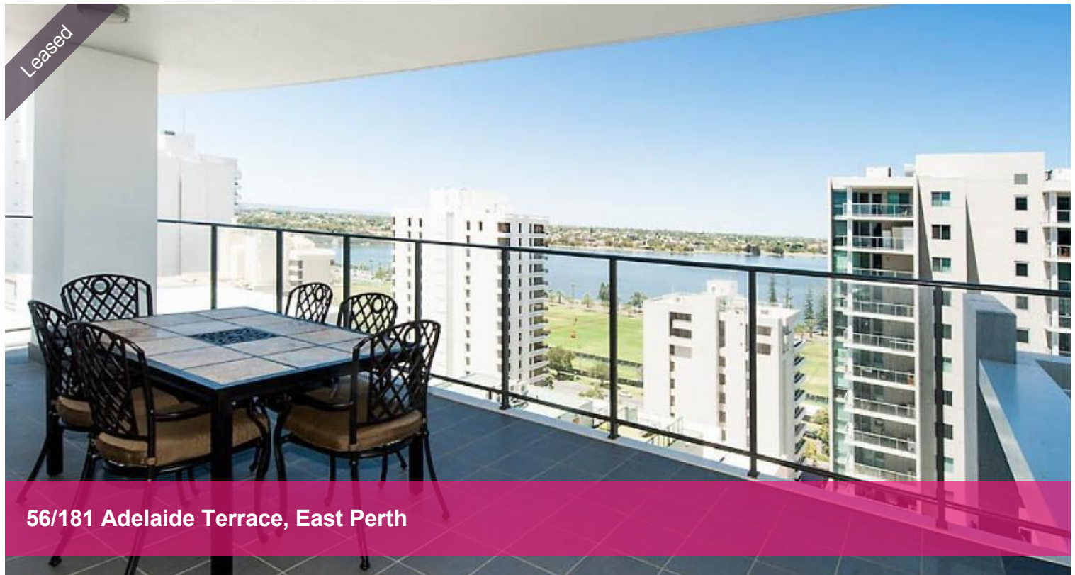
56/181 Adelaide Terrace, East Perth