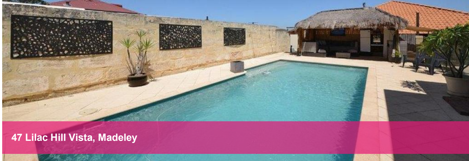
47 Lilac Hill Vista, Madeley