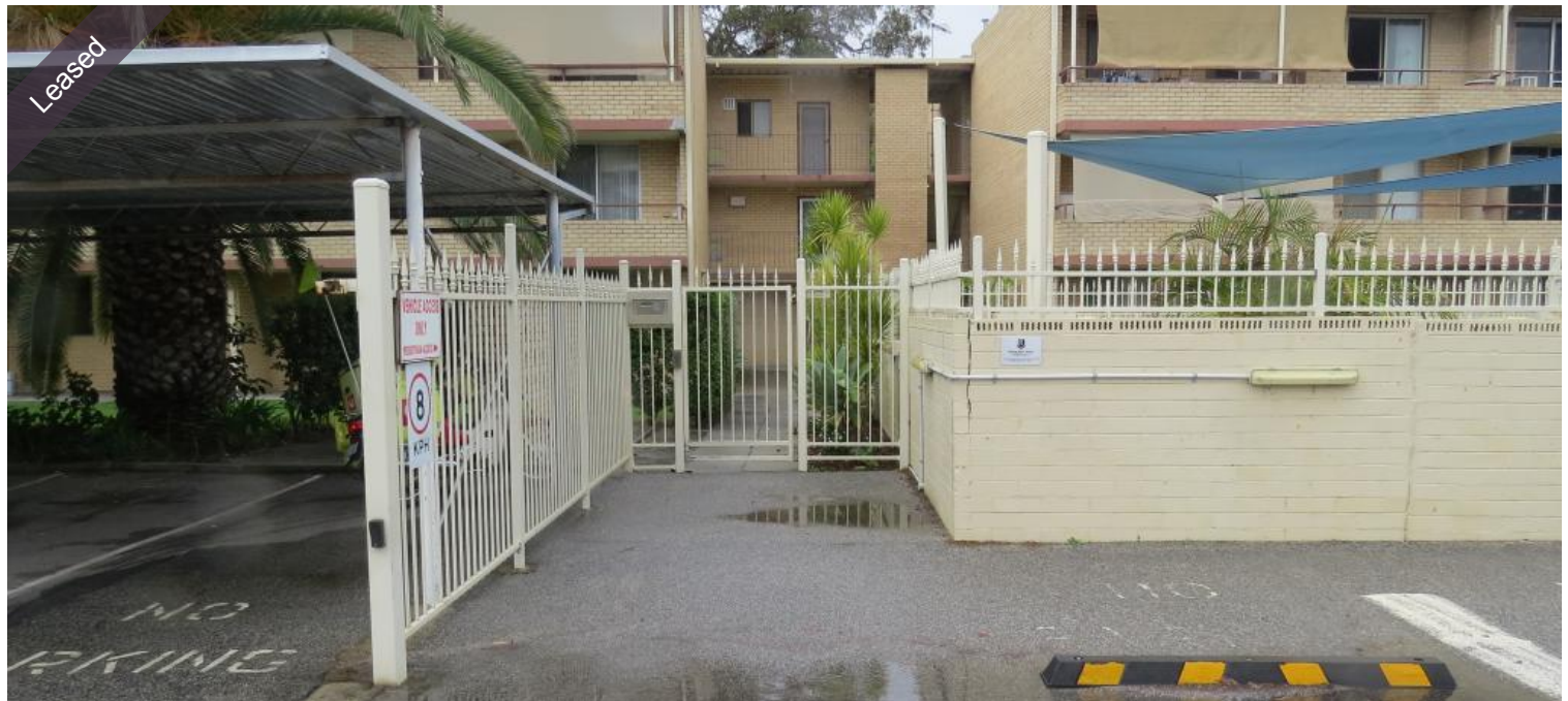
66/99 Herdsman Parade, Wembley