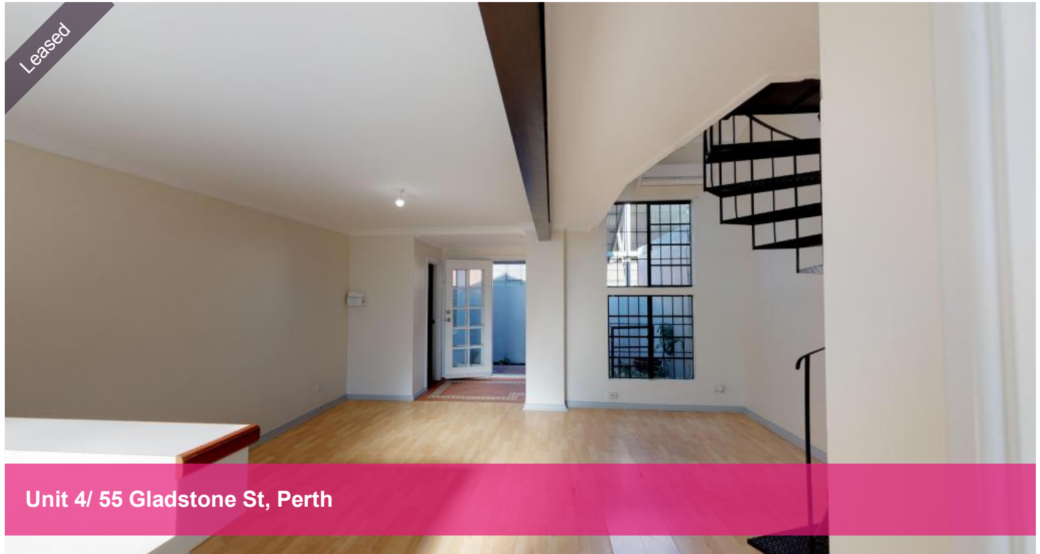
Unit 4/ 55 Gladstone St, Perth