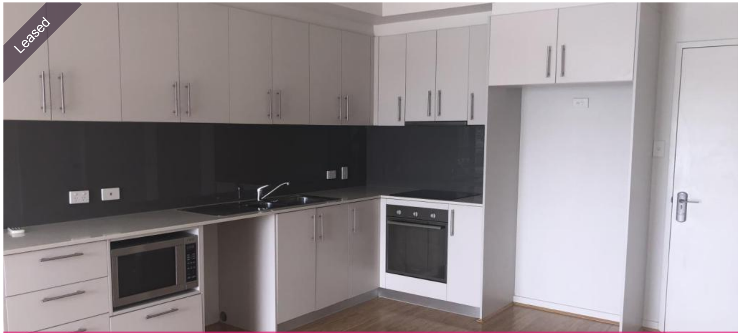
Unit 38, 177 Stirling St, Perth