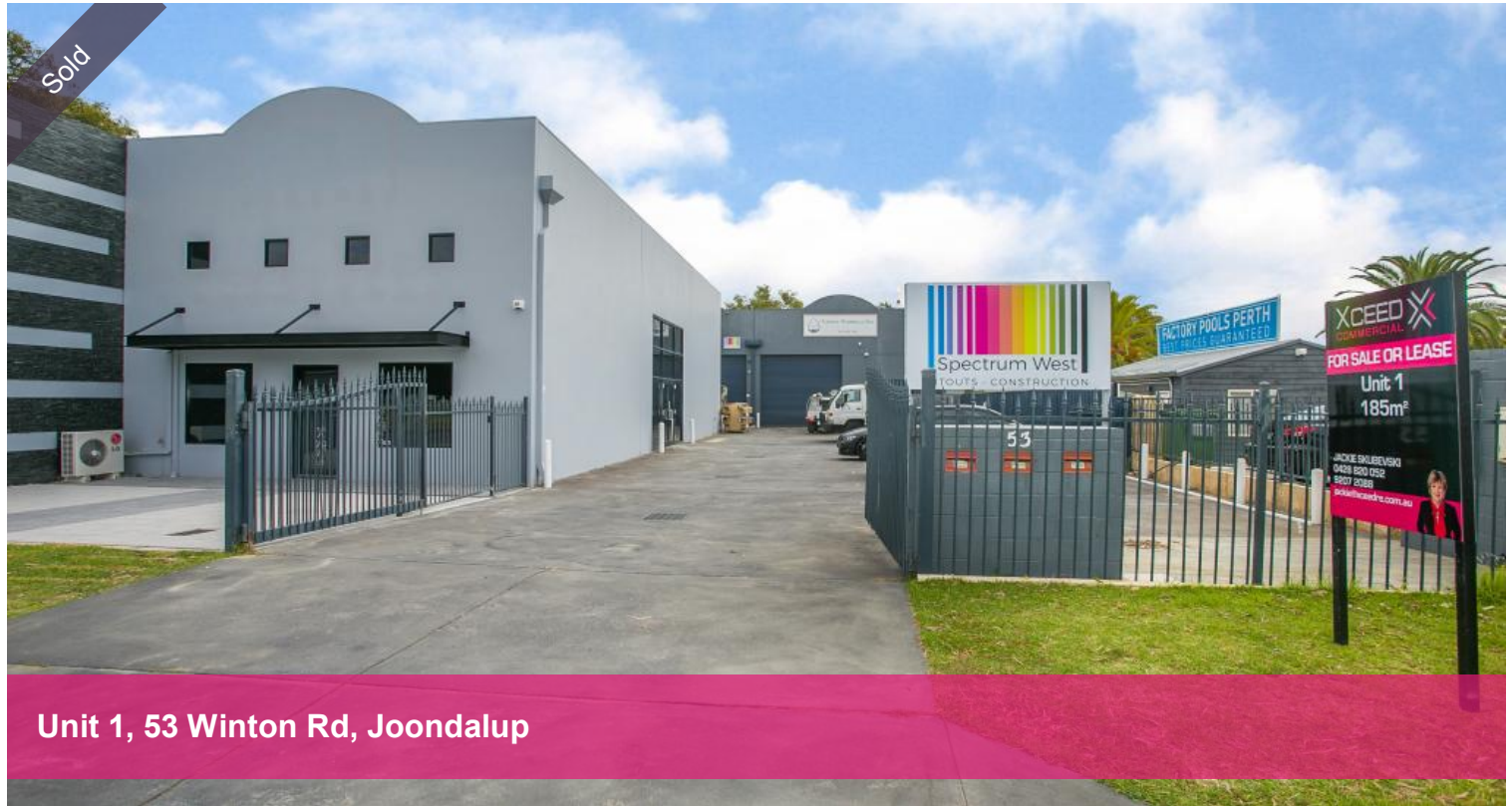
Unit 1, 53 Winton Rd, Joondalup