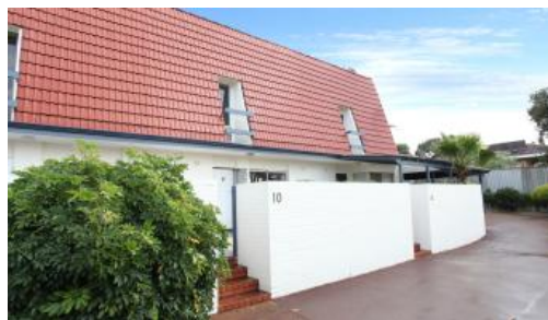
Unit 10, 77 Short Street, Joondanna