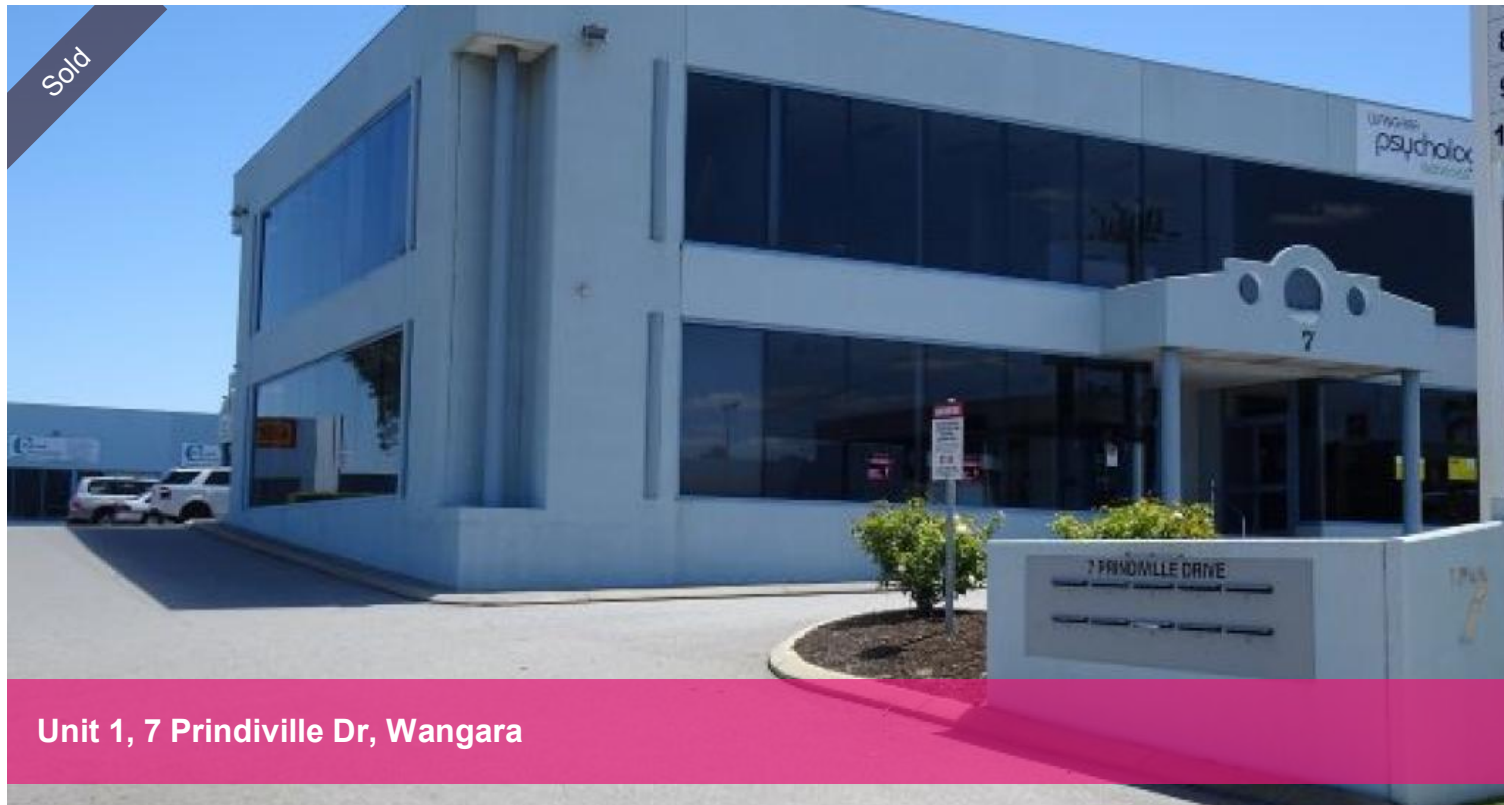
Unit 1, 7 Prindiville Dr, Wangara