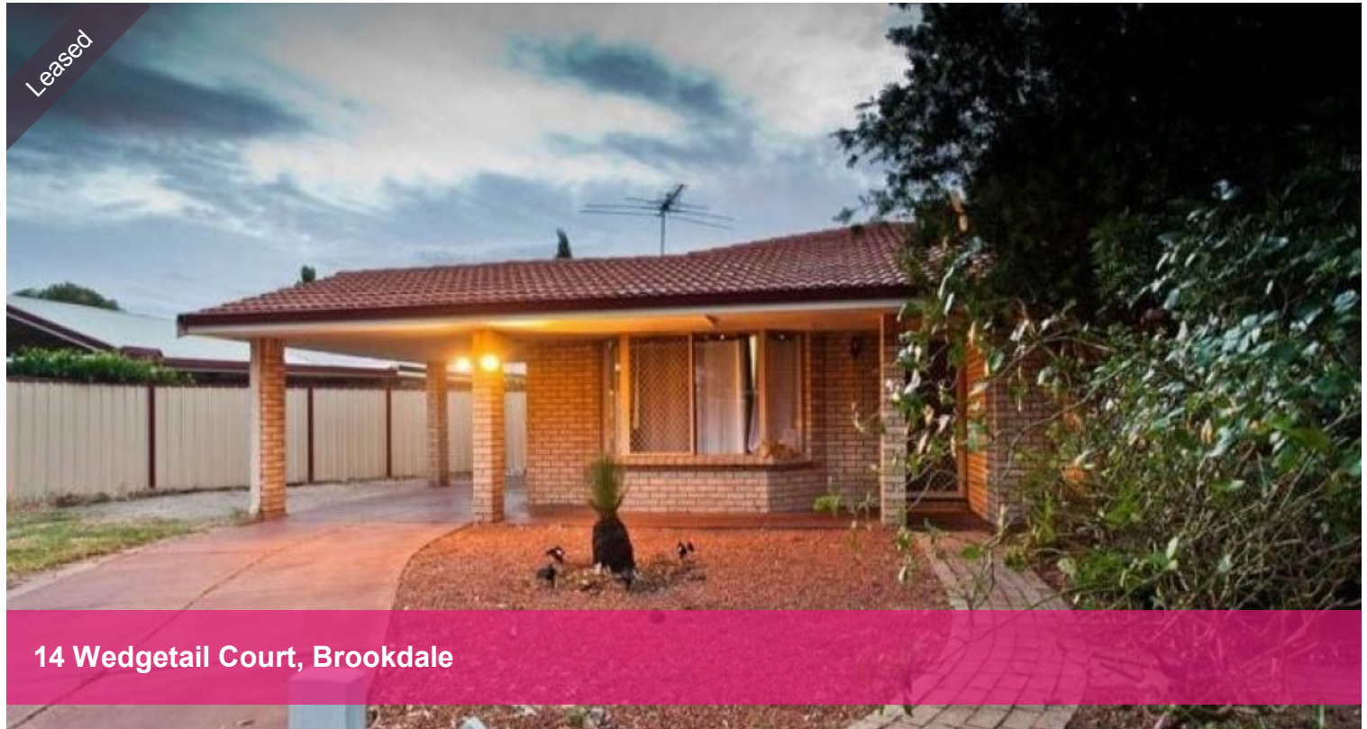
14 Wedgetail Court, Brookdale