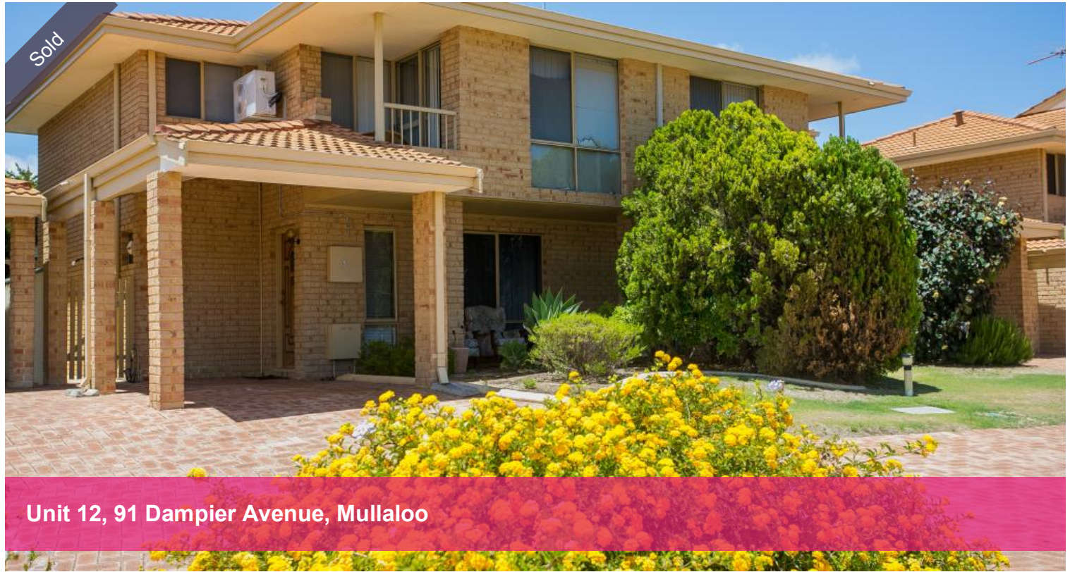
Unit 12, 91 Dampier Avenue, Mullaloo