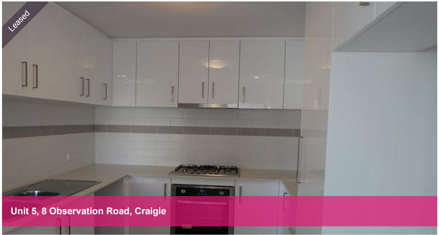
Unit 5, 8 Observation Road, Craigie