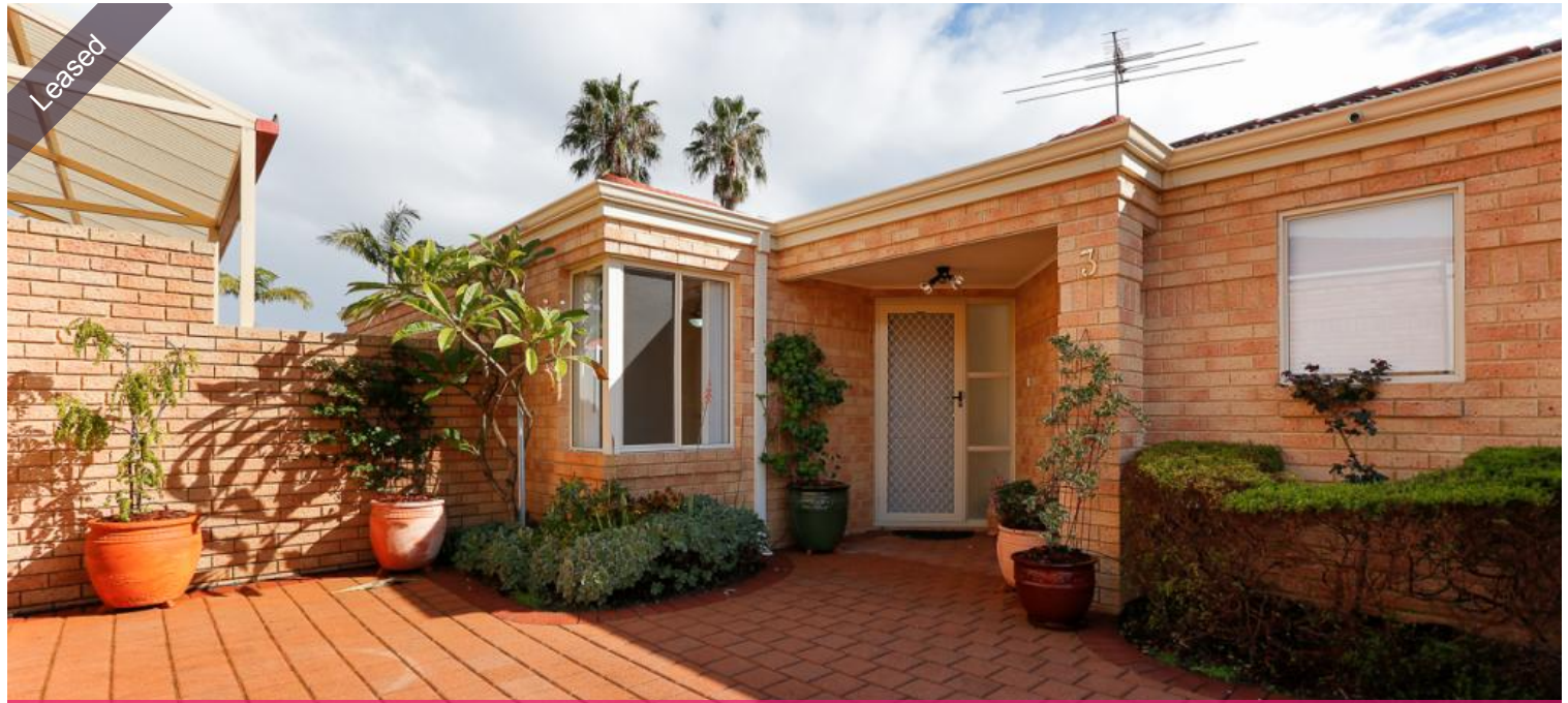
Unit 3, 11 Camden Street, Dianella