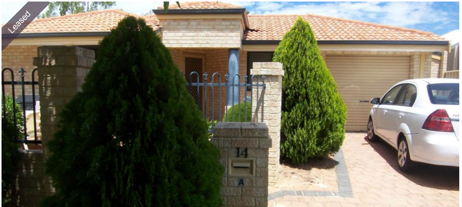
14A Medhurst Crescent, Nollamara