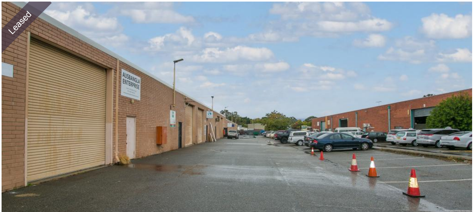
Unit 3, 26 Rudloc Rd, Morley